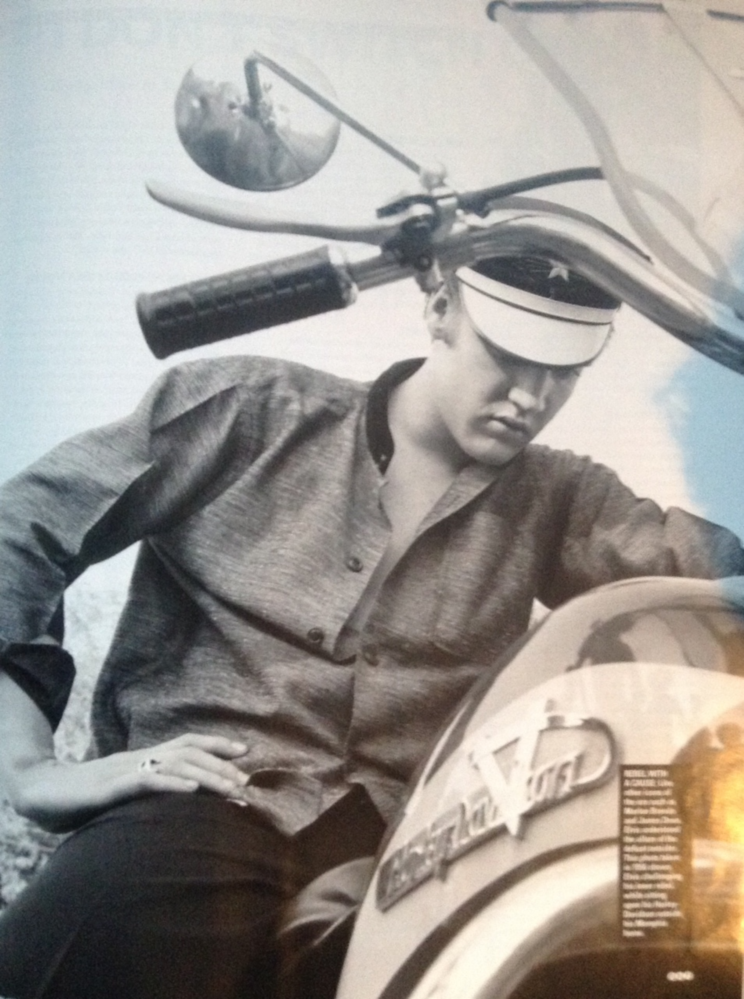
REBEL WITH A CAUSE: Like other icons of the era such as Martin Luther King and James Brown, Elvis understood the value of the defiant attitude. This photo taken in 1955 shows Elvis challenging his image while sitting upon the Harley Davidson motorcycle he brought home.