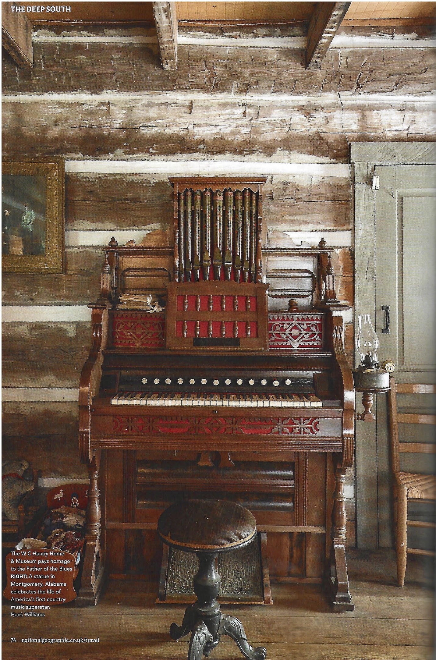
The W C Handy Home & Museum pays homage to the Father of the Blues RIGHT: A statue in Montgomery, Alabama celebrates the life of America's first country music superstar, Hank Williams