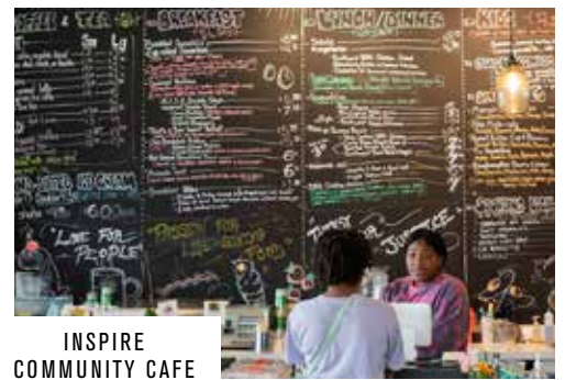
INSPIRE COMMUNITY CAFE

The coffee industry has historically exploited people of colour via slavery and colonisation; now Cxffeeblack is on a mission to reclaim java's Black heritage. The indie documentary Cxffeeblack to Africa follows the brand's recent visits to Rwanda and Ethiopia, chronicling its all-Black seed-to-cup supply chain. And sales profits are "contributing to education in Ethiopia as well as in the 'hood in Memphis," says Jones. "The idea of reclaiming peace in communities is really powerful to me." In Memphis, Cxffeeblack has opened the Anti-Gentrification Cxffee Club, offering rocket-fuel pour-overs and training for young Black baristas and roasters. A ripple effect has prompted other coffee producers in the city to follow suit, from Memphis Grindhouse supporting literacy in neighbouring schools to Boycott Coffee creating a pop-up space for immigrants and ESL students to practise speaking English over a craft brew. ZOEY GOTO zoeygoto.com ; memphisgrindhouse.com ; boycottcoffee.com