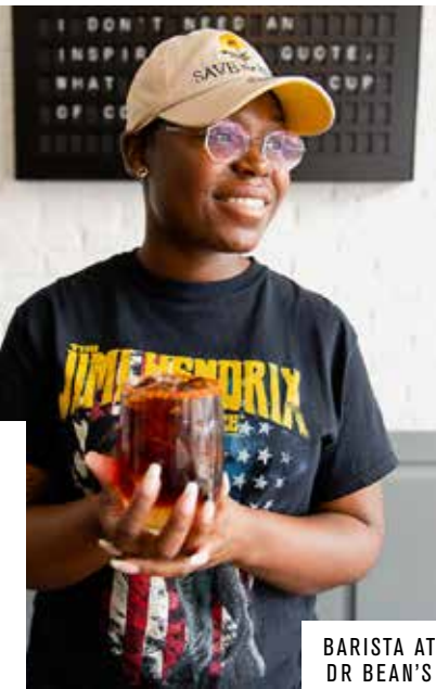
BARISTA AT DR BEAN'S